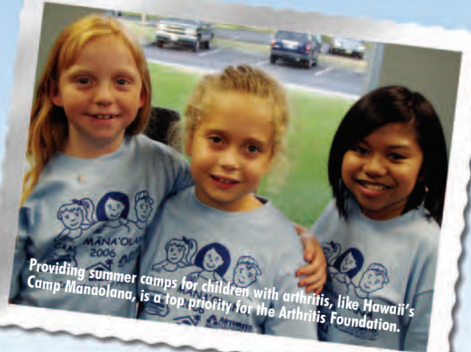
Providing summer camps for children with arthritis, like Hawaii's Camp Manaolana, is a top priority for the Arthritis Foundation.